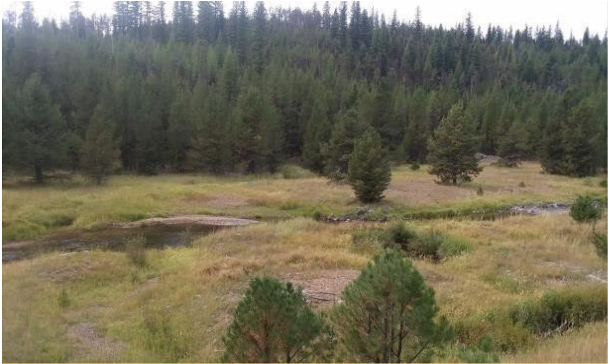
▲ Photo 2. Pre-restoration conditions along Granite Creek, located in Grant County.