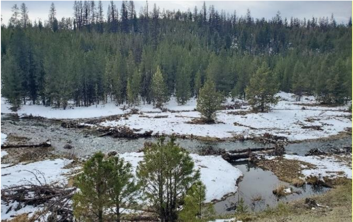
▲ Photo 3. Post-restoration conditions completed in 2023 by the Confederated Tribes of Umatilla Indian Reservation along Granite Creek to increase channel complexity and floodplain connection.