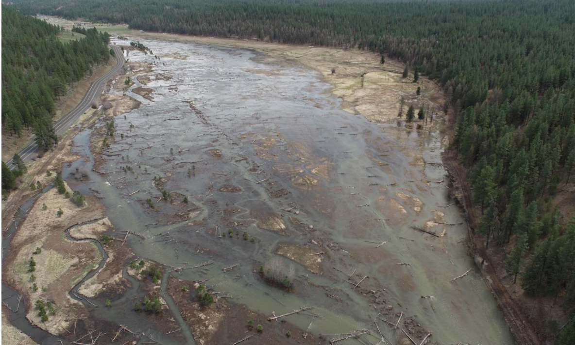
▲ Photo 7. Restoration along Middle Fork John Day River, Confederated Tribes of Warm Springs, May 2, 2023.