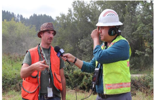
▲ Photos 6. Photos from a largescale floodplain restoration project that was initiated by the Confederated Tribes of Coos, Lower Umpqua and Siuslaw Indians in 2023 in the Siuslaw River Estuary.

The OWEB Board has $11 million available in its 2023-2025 spending plan to award new FIP initiatives during this biennium. OWEB hosted pre-application consultations with