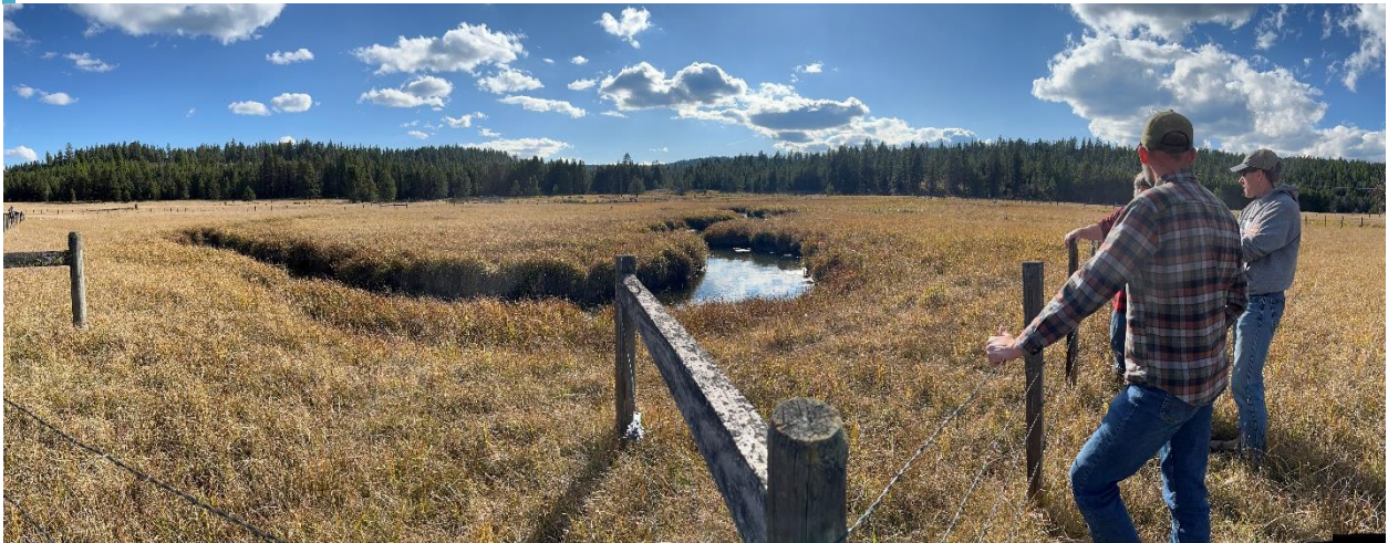
▲ Photo 5. Local partners discuss restoration potential along the Middle Fork John Day River at Phipps Meadow

The Phipps Meadow property is an important OWEB investment—made through the land acquisition grant program in 2023—for land conservation and future restoration efforts. With an OWEB grant in the amount of $818,550, the Blue Mountain Land Trust (BMLT) has purchased the 278.74-acre property in Grant County, 18 miles east of Prairie City. Phipps Meadow includes 1.58 miles of the John Day River, including the headwaters of the Middle Fork, and 108 acres of surrounding wet meadow. The Middle Fork of the John Day River provides spawning and rearing habitat to Mid-Columbia steelhead, Mid-Columbia chinook, and bull trout. BMLT plans to work with the Confederated Tribes of Warm Springs, the Bureau of Reclamation, and the Forest Service to restore and protect the property's riparian habitat, improve channel connectivity and complexity, raise the meadow's water table, improve soil health, and thin the overgrown pine uplands. In September 2023, OWEB Executive Director Lisa Charpilloz Hanson along with OWEB staff Amy Charette and Ken Fetcho, attended a field tour of this property to see the newly acquired land and hear from the partners on how they plan to proceed with stewarding and restoring this valuable property into the future.