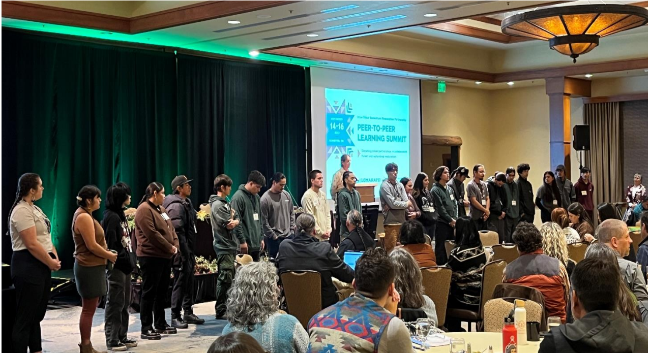
▲ Photo 9. Tribal youth being honored at the Peer-to-Peer Learning Summit hosted by Lomakatsi Restoration Project and the Inter-Tribal Ecosystem Restoration Partnership.

The Tribal Liaison also continued to attend the State/Tribal Natural Resources Workgroup quarterly meetings in 2023 to provide relevant updates to tribes and to better understand issues of importance to the tribes.