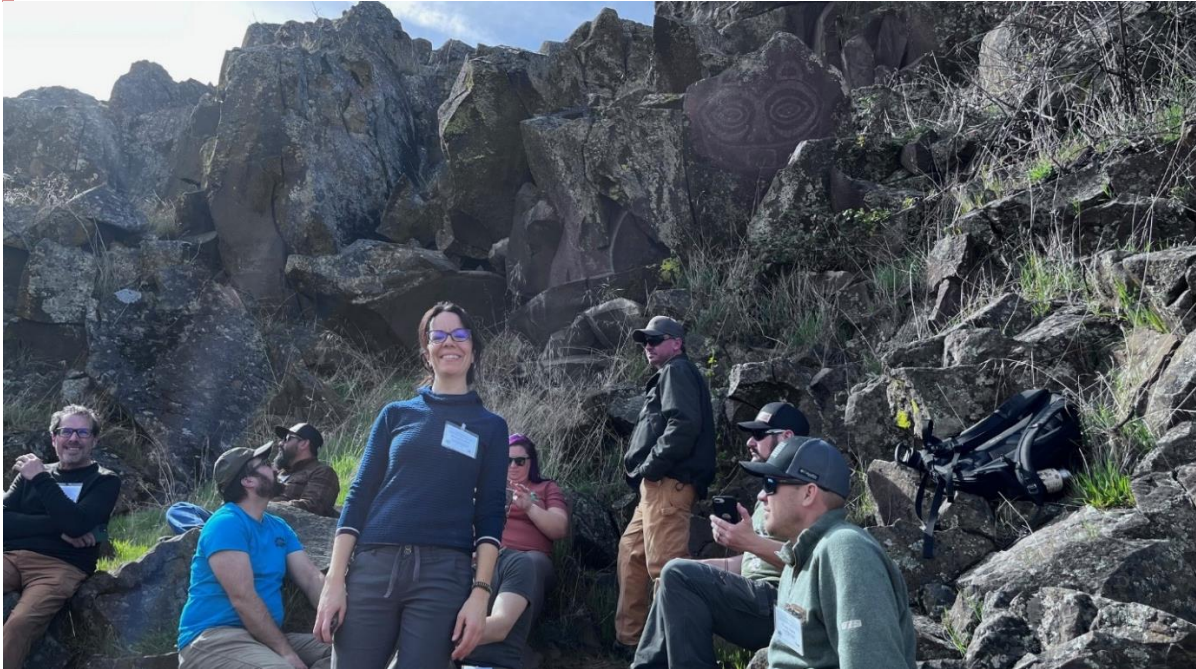
▲ Photos 8 (above). Photos of OWEB staff attending a field trip to visit She Who Watches and (below) OPRD staff teaching the class how to throw an atlatl.

an opportunity to help OWEB further foster our relationships with the tribes in Oregon as we work on a topic that is of the utmost importance to tribal governments.